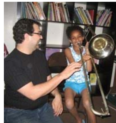
Children played various instruments during an educational session.