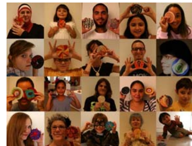
Lots of Tops