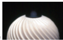
William Hunter, Untitled Vessel on Stand

have observed, Hunter's early works in wood investigated the medium's rich expressive potential and advanced a new direction for the field of contemporary wood sculpture."