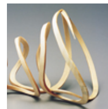
Mark Hancock There and Back Again , 2003 Maple 7 1/2 x 11 x 7" $3,450 + s/h