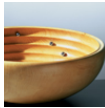
Siegfried Schreiber, Universe

Full article with images Text-only version