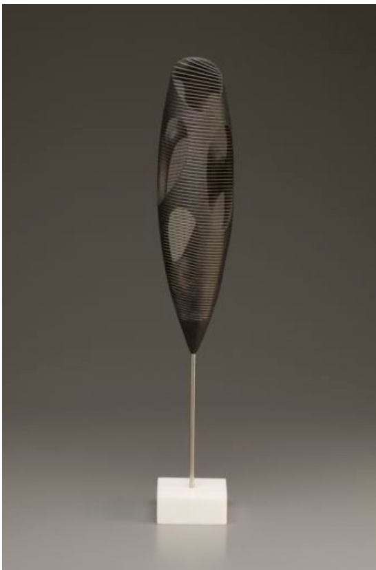
Osmose, 2009 24" H x 4" Diam. Maple, stainless steel cable

This is the second year an ITE resident's work as been selected for the AAW's collection. In 2008. ITE resident Satoshi Fujinuma's work was selected for inclusion.