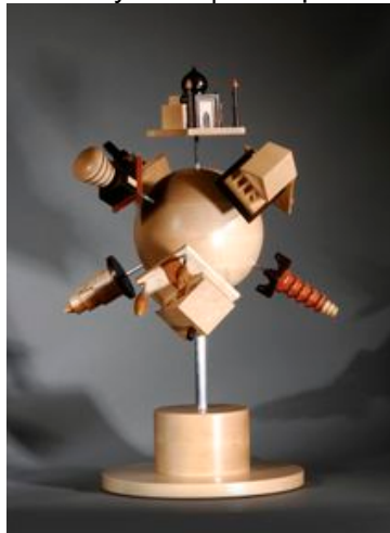
Rising Above Bedlam, 2008