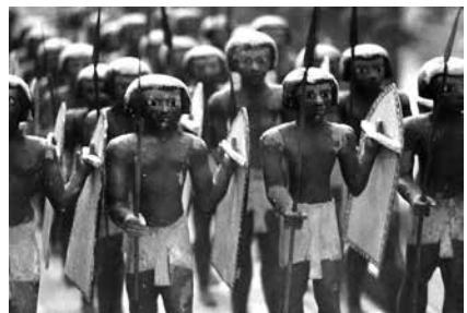
Eight soldiers from "The Lost Army," 2004-05